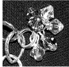
To order online, visit www.renzcenter.org/sc/hopebracelets.php

clasp. Both bracelets have a sterling silver "Hope" charm. Griggs will be available at Epicurean Delight to size bracelets and attach the new 2010 charm.